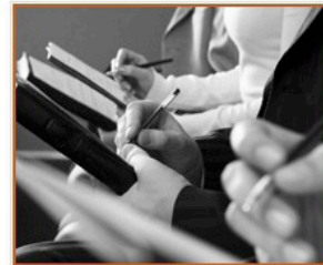
Brand and Corporate Comms »