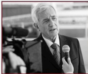
Media and Communications »