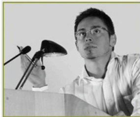
Presentation and Comms »