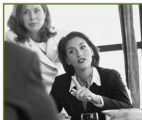
Chairing and Facilitation »