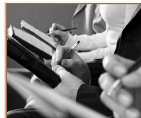
Brand and Corporate Comms »