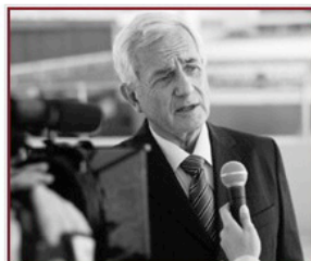
Media and Communications »